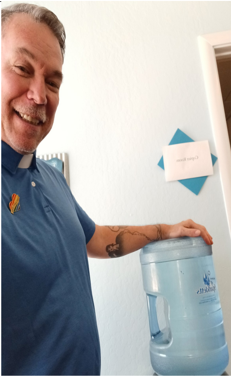
The Office now has drinkable hot or cold water.! Hot tea, coffee, or cold water are also available.

Isaiah 55:1- "Come, all you who are thirsty, come to the waters;