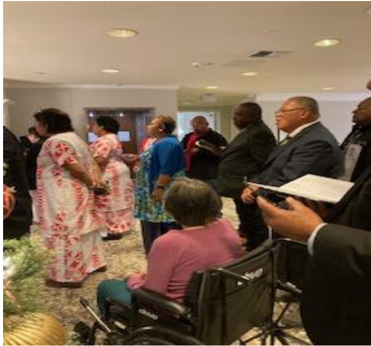
The Choir and a Resident (seated in chair)